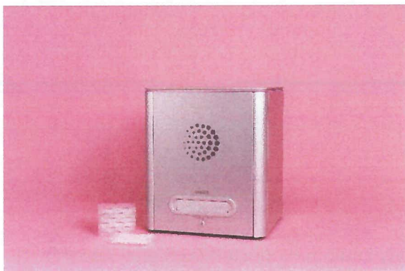
Mabtech IRIS™ 2